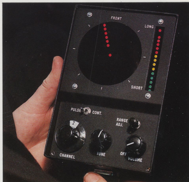
DISPLAY UNIT TYPE 7112

The display unit houses all the operating controls for the receiver and also displays the indications of bearing and range. The unit can be hand held or mounted on the dashboard of the vehicle. The display unit is also fitted with a loudspeaker which enables the target status to be monitored using a special audio signal.